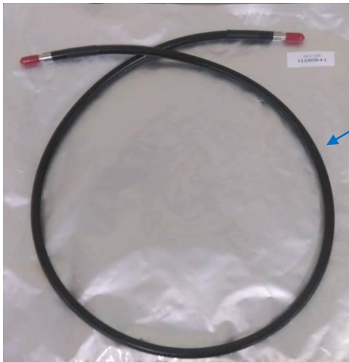
Liquid Light Guide (1.5m )